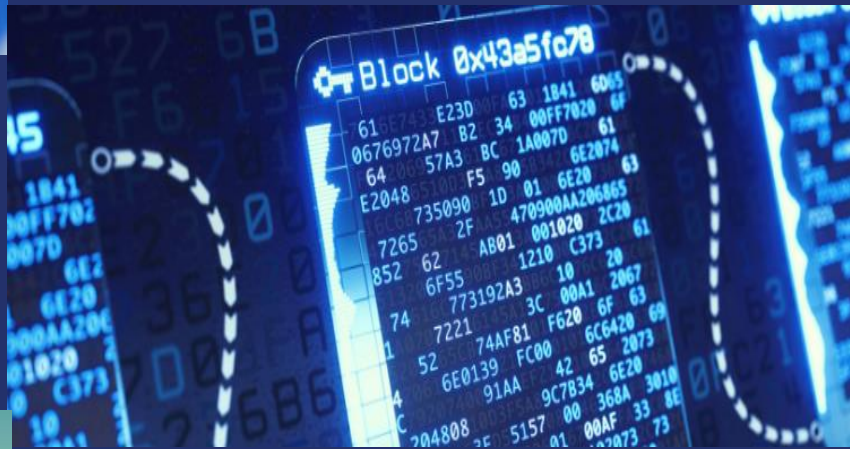
Legally Speaking, is Digital Money Really Money?