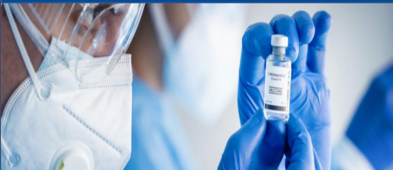
A Race Between Vaccines and the Virus as Recoveries Diverge اضغط هنا للعربية