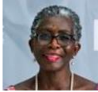
International Cooperation: Strengthening Economic Institutions for Sustainable Development