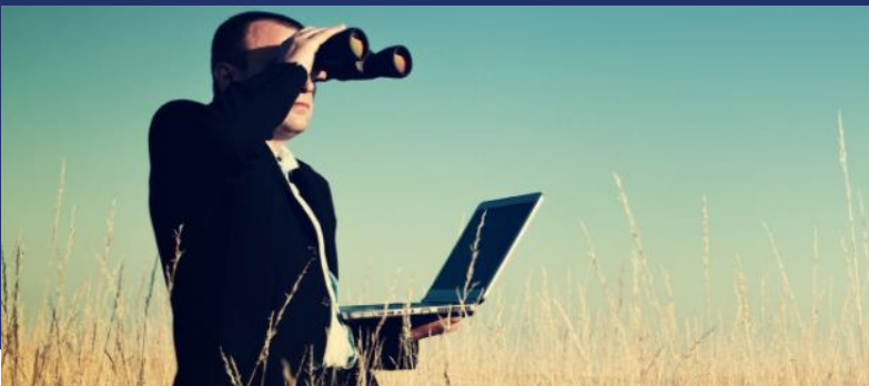
The Jobs of Tomorrow